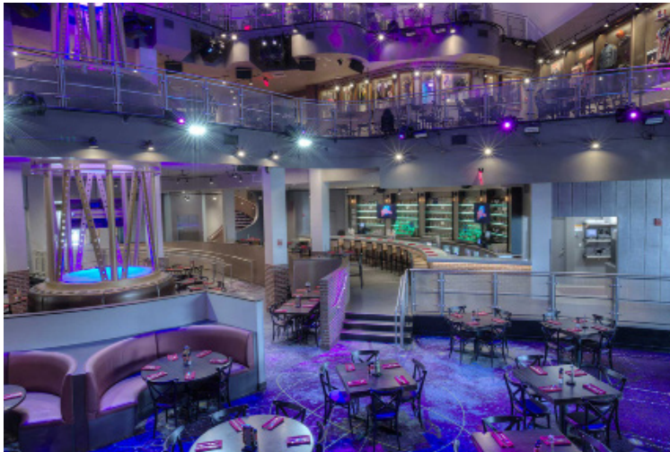
Planet Hollywood Wednesday's Welcome Reception