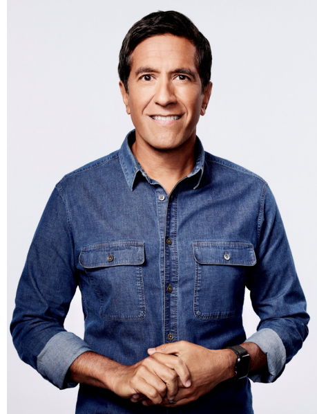
Sanjay Gupta CNN Chief Medical Correspondent