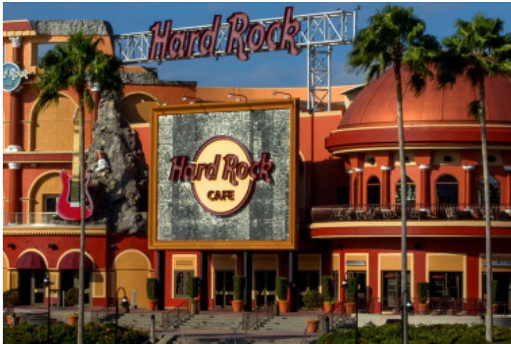
Hard Rock Live! Friday Night's Reception