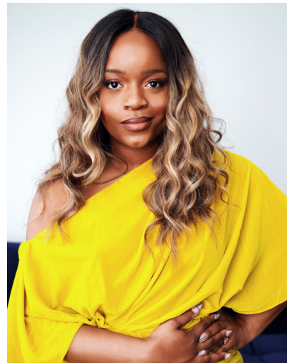
Brittany Packnett Cunningham Social Justice Activist & Educator