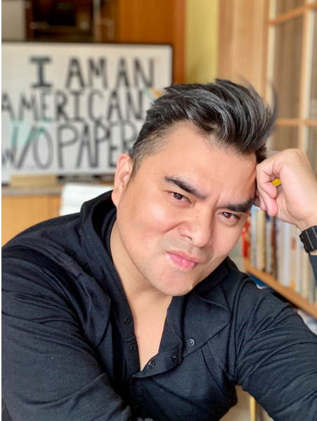
Jose Antonio Vargas Journalist & Immigration Advocate

Conference Registration Urban Schools Resource Room/Internet Cafe General Session C: Breakfast and Speaker: JOSE ANTONIO VARGAS CONCURRENT SESSIONS ON BEST PRACTICES General Session D: Lunch and Speaker: SANJAY GUPTA General Session E: Town Hall Meeting Great City Colleges of Education General Meeting Reception at Hard Rock Live!